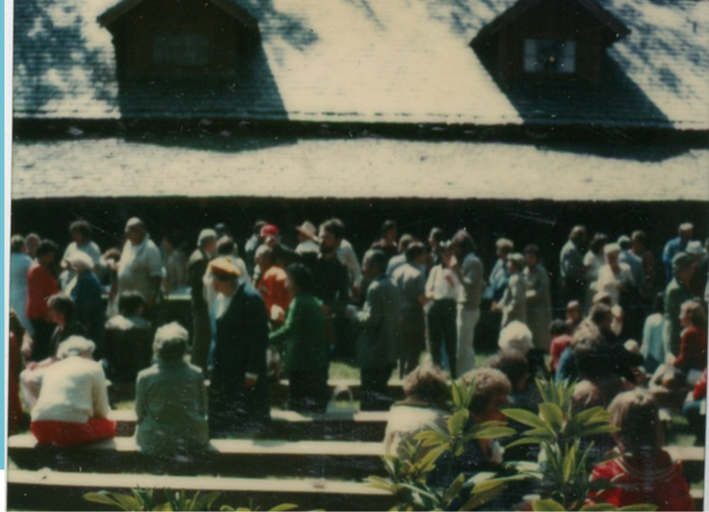
SRHS#2920 visitors at opening of outside exhibits, June 15, 1980

Goal: Ensure Sooke Region Museum & Visitor Centre is in a strong position to serve the community for the future.