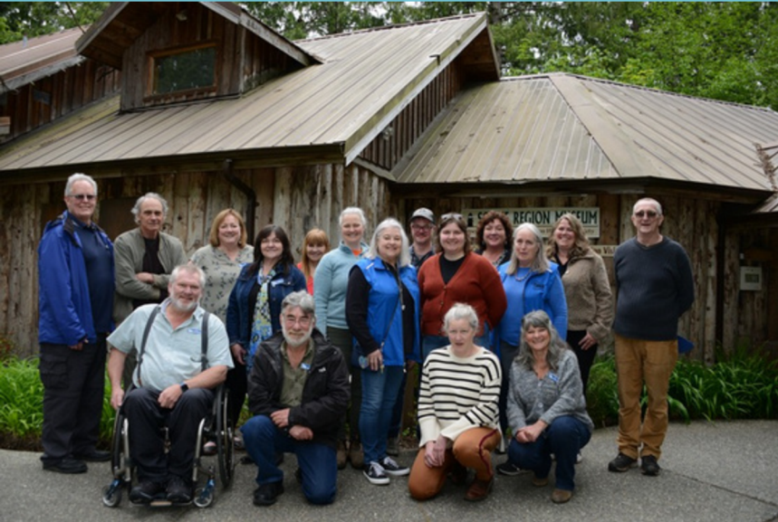
Board of Directors and Staff, May 2024

Members support operations through fees, shopping at our gift shop and participating in programs.