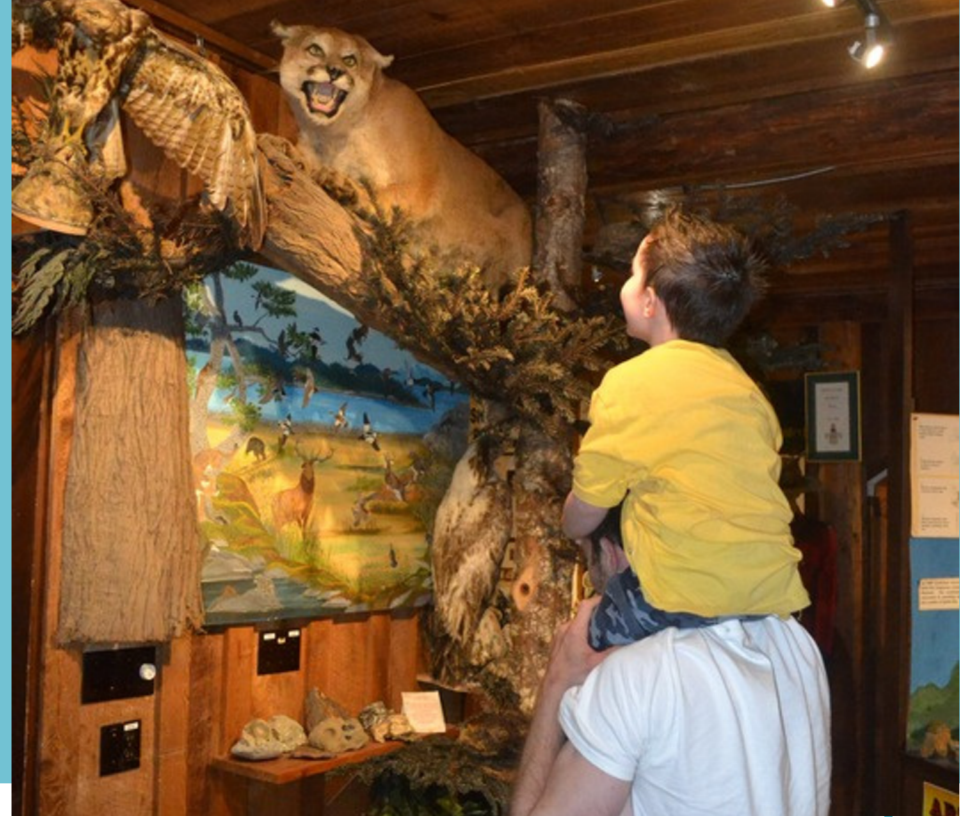
visiting Cedar the cougar inside the Sooke Region Museum

Goal: Present engaging narratives to help visitors relate to local culture, history and nature, creating a memorable experience.